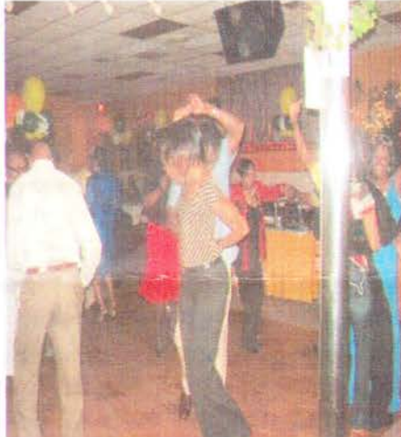
Reunion Cabaret May 2, 2009