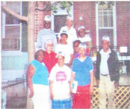
SCA Celebrates 18th! September

...Thanks Charter Members for making it all happen in Sept. 1991! Your good work continues to make a difference today!