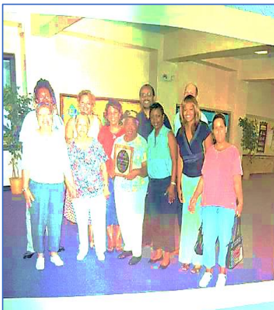
Stronghold community residents.