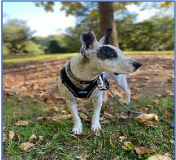
Zerra See McNeill write-up page 2 June 2024

--Edwin T. Aiken, Sr. (aka "Boyzie") November 2023 {Photo, page 1}